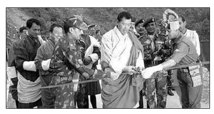
Dasho Leki Dorji inaugurates the bypass

The bypass, completed in partnership with India, is, according to chief engineer Brigadier Amitava Sarker, 'yet another symbol of friendship' between India and Bhutan. 'It will not only end the traffic disruptions at Sorchen, but