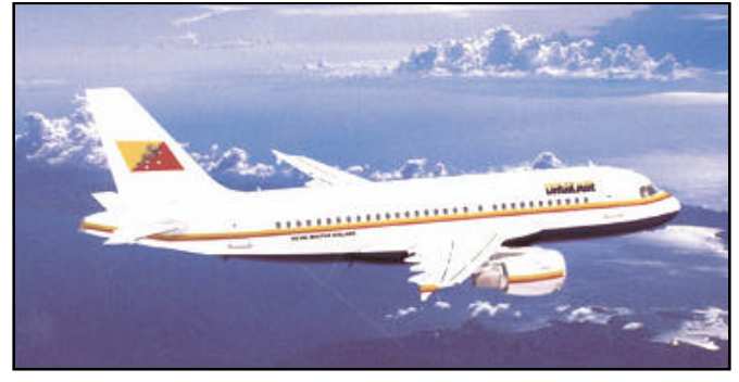
The Airbus A319

by Gopilal Acharya & Gyaltsen K Dorji, Kuensel Online Druk Air will replace its present fleet of two BAe 146 aircraft with two larger jets, the Airbus A319, next year. The decision was made by the Council of Ministers after an appraisal report by Druk Air, demonstration flights and discussions with several aircraft manufacturers.