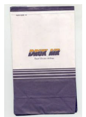
A Druk Air air sickness bag – well worth collecting?

There is apparently quite a market for these items, know among collectors as 'barf bags', and rarer examples such as those of Druk Air can fetch large sums of money.