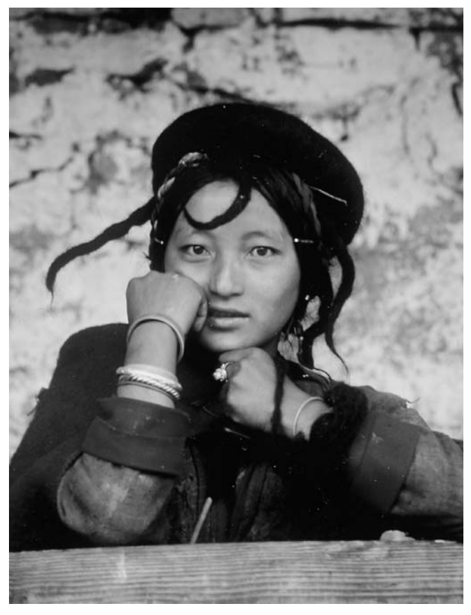
One of the photos to be included in the exhibition: A Bragpa woman from Mera in the far eastern part of Bhutan (1991)