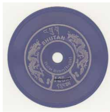
The Bhutanese record stamp of 1973: treasured by collectors!

Alternatively contact the company by phone in the USA on: 00-1-412-521-0400, or by fax on 00-1-412-521-2008. Non-philatelists will also enjoy browsing this beautifully