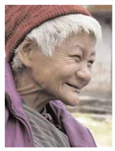
but she's a big fan of Gross National Happiness!