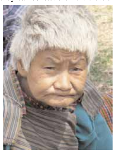
She's not too sure about democracy...