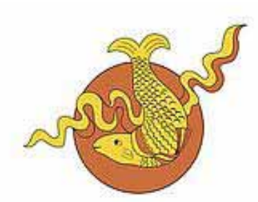
Tashi Air logo

In another milestone for Bhutanese aviation, air travellers will now have a choice on the popular Paro -Bangkok air route. Tashi Air, operating as Bhutan Airlines, the first privately-owned airline in Bhutan, launched its international operations with flights between Paro and Bangkok on October 10, 2013 flying an Airbus A320. This will mark the first time the national airline Drukair will be facing a competitor on its lucrative Paro to Bangkok sector which was established by them in 1989.