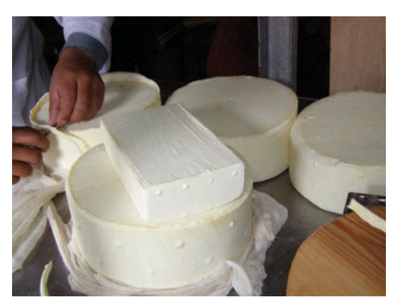
A livestock official demonstrates how the edges are trimmed before the cheese is packed and sold off.

When it comes to achieving self-sufficiency in milk and dairy products, latest reports show Bhutan has achieved over 90% of domestic requirements. The market value of these milk and milk products is about Nu 1816.66mn. In addition money is earned from the sale of other minor milk products, like Swiss cheese, yoghurt, fermented cheese (yetpa), ice cream, paneer, etc. In efforts to achieve 100% self-sufficiency, good dairy cow breeds with 30% subsidy are distributed to farmers. In addition, the Government has also sought expertise to source 2,000 cows from India.