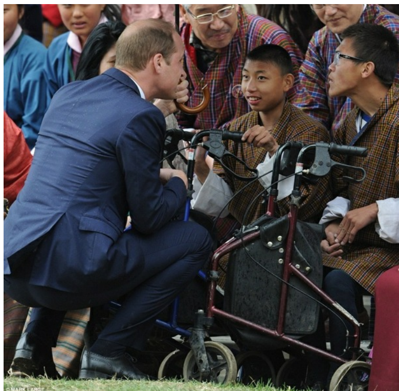
HRH Prince William talking to recipients of special needs equipment previously provided by Physionet UK

Readers will remember that the first shipment of equipment to Bhutan transformed recipients' lives in 2015 (see Society's Newsletter 55 and www.physionet.org.net ).