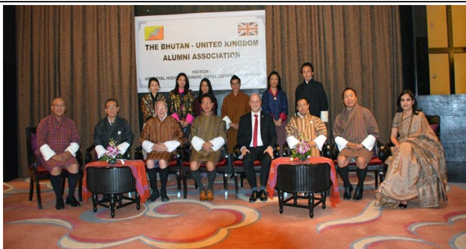
Chevening Scholarship Reception with The Bhutan -United Kingdom Alumni Association in Thimphu

The Society's AGM, and follow up talk by our Chairman, will be on Tuesday October 4th at The Travellers Club in London. Agenda and other details in last issue