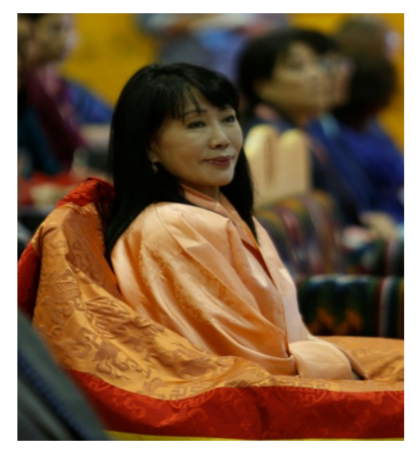
The festival is free and open to all. To register and for more information visit: www.mountainechoes.org

Her Majesty The Royal Queen Mother Ashi Dorji Wangmo Wangchuck is the Patron of the Festival.