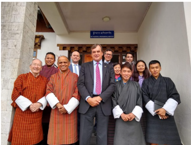
Visiting Royal Thimphu College

The High Commissioner and the British Honorary Consul hosted an evening Reception in Thimphu which was attended by the Foreign Minister, the Health Minister, the Agriculture Minister, the Chief Justice of Bhutan, the Chairman of the Royal Privy Council, members of the Diplomatic Corps and