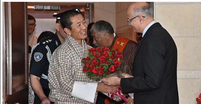
Dr Lotay Tshering, Prime Minister of Bhutan, arrives in Delhi to attend the swearing in of Prime Minister Modi