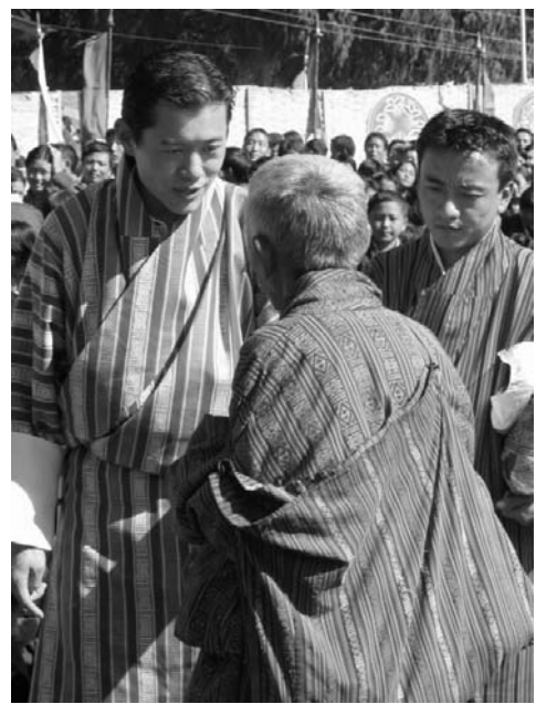
HRH the Chhoetse Penlop talks to an elderly man among the crowds of well wishers at Trongsa

"There is no greater honour than to follow in the footsteps of His Majesty the King, for this means only one thing — being in the service of the nation", His Royal Highness has said. "My goals and aspirations are lodged within those of my country. My foremost desire is to work for the greater good of the nation and the Bhutanese people."