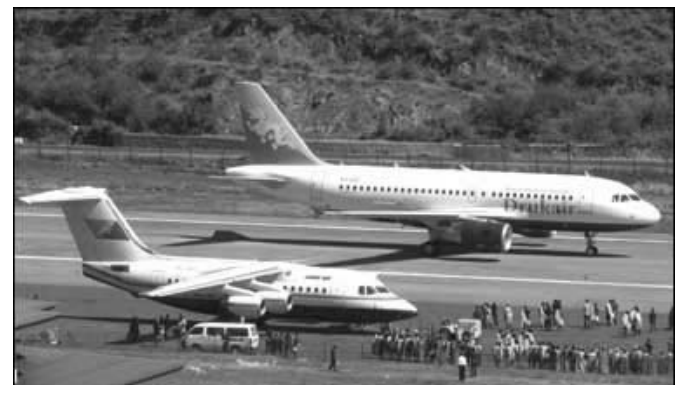
One of Druk Air's new Airbus 319s, with the old BAe 146 in the foreground. The Airbuses have greater capacity and range.

Druk Air's two US$ 40 million Airbus 319s are now in service. The new planes were welcomed in a traditional Chipdrel ceremony by the finance minister Lyonpo Wangdi Norbu, the chairman of Druk Air, the Paro Lam Neten, dzongkhag officials and Druk Air staff.