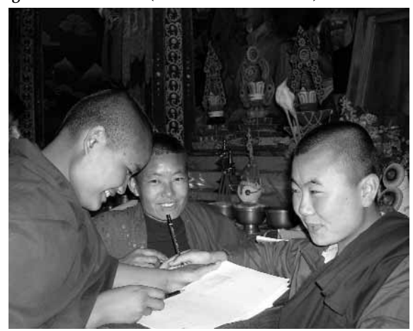
Smiling nuns carry out a risk management assessment

Following that meeting, I studied Himalayan Buddhist iconography, receiving an MA in Asian Art History and an MSC in Art Conservation. I also worked and studied at ICCROM in Rome. I teach thangka conservation and consult for major museums and monasteries. In 1980 I consulted for the London Buddhist Society and in 1992 worked on the thangkas in Rumtek Monastery. In 2005 I taught at University of Melbourne and in China, and in 2006 will teach in Toronto's Royal Ontario Museum, in New York and in Russia.