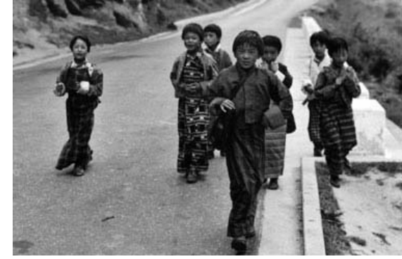
Young girls on the way to school, Trongsar