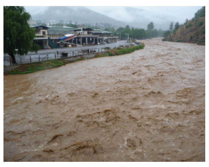
River scene close to the Sunday market in Thimphu

Nine people were killed. Six died in Bumthang, including two women and four men, who were buried under a landslide while collecting cordyceps and two school students aged 8 and 16, both from Thimphu, were caught in the floods. The other flood victim was a dantak labourer in Chukha.