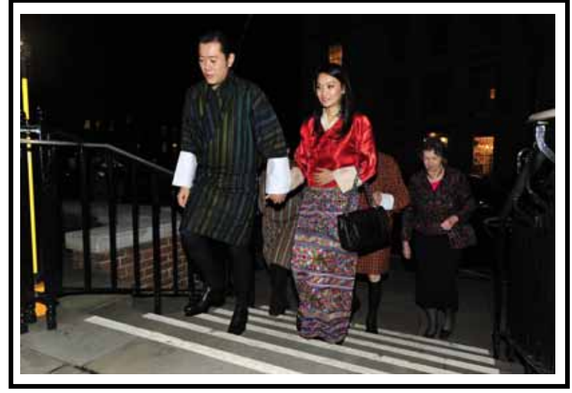
Their Majesties, the King and Queen of Bhutan arriving at the Society's 20th Anniversary Dinner