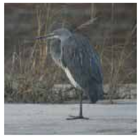
White bellied heron

Six birds have been added to the list of protected wild animals in Bhutan under the Forest and Nature Conservation Act. They include the white-bellied heron, chestnut-breasted hill partridge, white-rumped vulture, beautiful nuthatch, blyth's tragopan and satyr tragopan. This, forestry officials said, was the first change since the Act's introduction in 1995, taking the total number of protected wild animals to 30 different species. The birds are