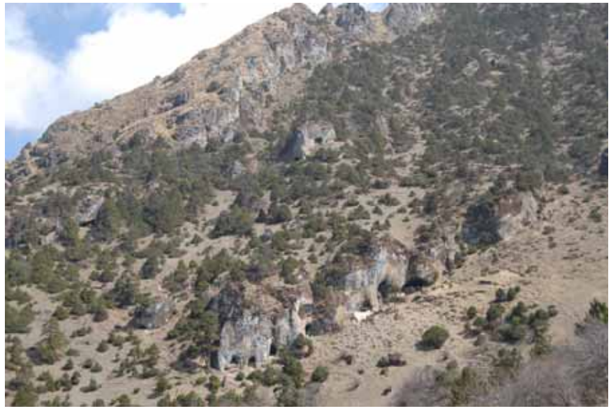
Caves, Upper Thimphu Valley

The Bhutanese Government is keen to develop Bhutanese archaeology. In 1999, a salvage excavation at a construction site in Bumthang became the country's first archaeological project. In 2008, the second archaeological excavation commenced at the ruins site of Drapham Dzong in Bumthang. There is no dearth of architectural ruins and potential archaeological sites in the Bhutanese landscape but a lack of legislation and clear strategy at present have inadvertently placed archaeology under those dealing with conservation of architectural heritage. Unsurprisingly, emphasis on Bhutanese archaeology so far has been on the study and conservation of architectural ruins. For balance, proposals for the study of limestone caves (upper Thimphu), burial mounds (Bangtsho), and highland lake sediments are being developed by