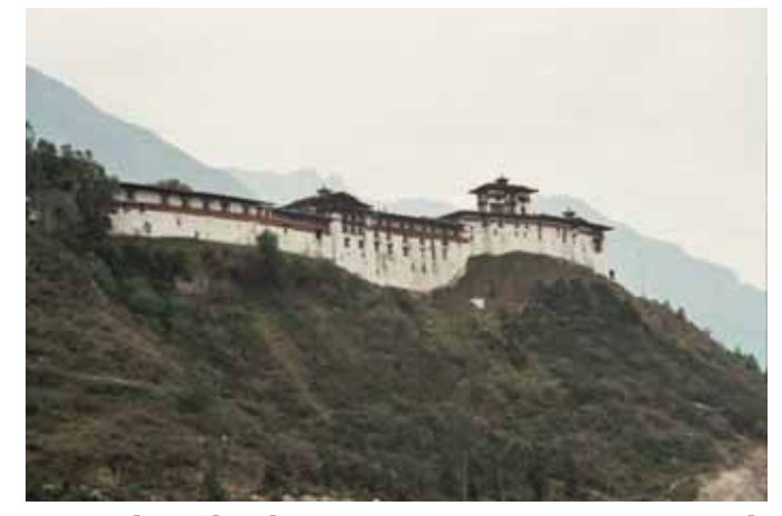
Wangduephodrang Dzong as we remember it - located dramatically on a ridge above the confluence of two local rivers.

the front part of the Dzong housing the civil administration have been destroyed, and many invaluable old records, statues and religious texts have also been lost. HM The King and HM The Fourth King were on the scene very soon after the fire started.