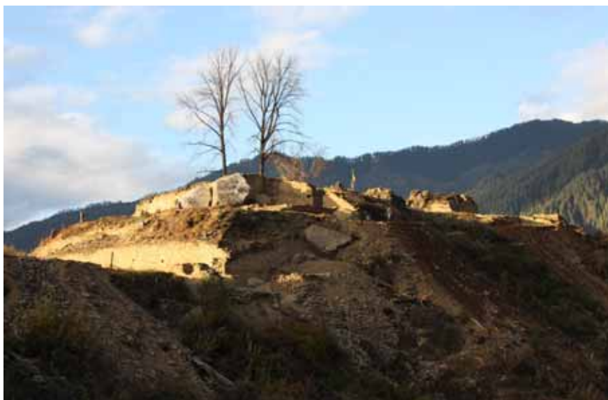
Drapham Dzong, Chhoekhor Toed, Bumthang

Much of recorded Bhutanese history begins in the 7th century of the general era with the construction of Paro Kyichu and Bumthang Jampa Lhakhang by the Tibetan King Songtsen Gampo. Nothing regarding the country is recorded before that period nor has there been any intentional search for knowledge for any earlier period. While written records of certain aspects of the Bhutanese experience, in particular its religion and religious figures are rich, major pockets of obscurity occur even within the historic epoch of the country. Furthermore historical records are often infused with fantastic supernatural events. In this regard, archaeology, with its unique advantage of uncovering physical records of events and people with little discrimination, can help us understand who we really are, beyond religion and landmark events, and how we got here.