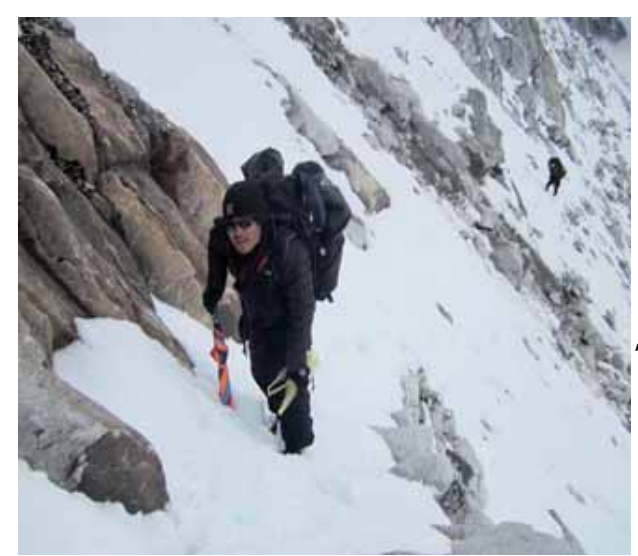
Election team cross Mount Ganjula on their way back to Gasa

With the onset of the monsoon, the snows had started to melt and, by the time of the general election in July, the entire route would be slippery and likely blocked. Election team members were provided with sunglasses, bag, mattress and plastic sheets - on a returnable basis - as well as rubber boots. These were to be well used! Their presiding officer said. "We met with small land-