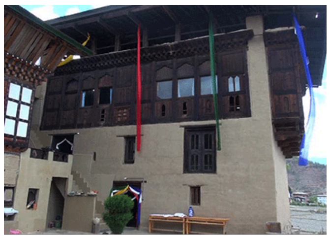
The 18th century home of the 23rd Paro Penlop recently converted into a Heritage farmhouse

Meanwhile the clouds of war were becoming ever more menacing. The next part of our journey was to visit the town of Paro. The Paro Penlop was particularly famed for the spectacular dances he put on with full theatrical costume. He had arranged to present a series of such dances in our honour. We were full of high expectation.