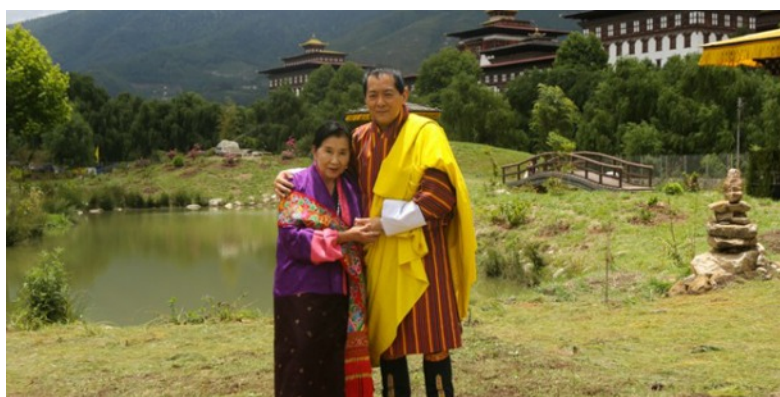
Her Majesty the Royal Grandmother and His Majesty the Fourth Druk Gyalpo at the Ludrong Memorial Garden in Langjophakha, Thimphu.

To commemorate the occasion, His Majesty The King planted a cypress tree, while His Majesty the Fourth Druk Gyalpo and Her Majesty the Royal Grandmother each planted a chinara (Platanus orientalis) sapling tree. These saplings were from the seeds of the rare species, that was originally brought from Kashmir, India and planted in Bhutan by Rani Mayum Choeying Wangmo Dorji, Her Majesty's mother.