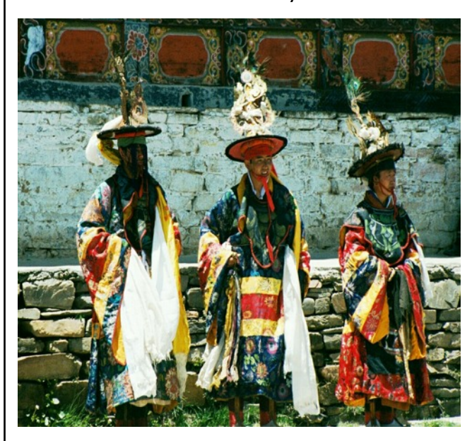
Dancers at Ura Tshechu

The Prime Minister recently announced the Government's decision to revise the salary and incentives for mask and folk dancers across the country.